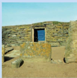
Knap of Howar

The stone built houses at the Knap of Howar are the earliest North European dwellings known, dating back to 3800BC. You enter by low, narrow passages to find houses furnished with hearths, pits, stores and stone benches.